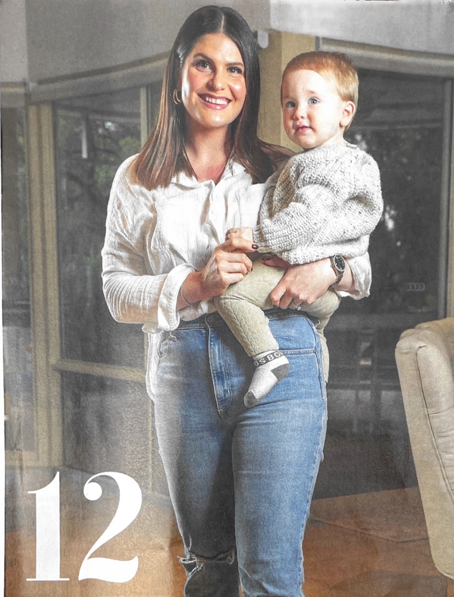
COVER: BILLIE-JEAN HAMLET